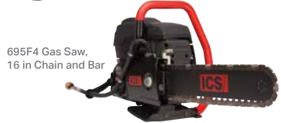
695F4 Gas Saw, 16 in Chain and Bar