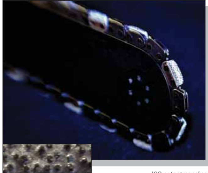
Braided Diamond Layer

* Asbestos is a hazardous material, known to cause serious respiratory diseases. Cutting into asbestos can release asbestos fibers into the air. Always research and follow the correct safety procedures, including applicable national and state or provisional occupational health and safety regulations, and protect yourself and those around you from asbestos-related disease. Always arrange for the material to be removed safely by a qualified person. ICS is not responsible for exposure to asbestos caused by use of this product.