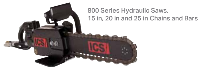
800 Series Hydraulic Saws, 15 in, 20 in and 25 in Chains and Bars