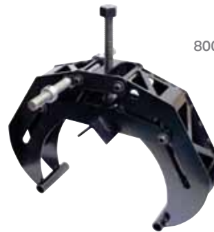
800 Series Pipe Clamp Accessory

In addition to the time saving value of PowerGrit technology, the pipe clamp accessory, designed for ICS 800 series hydraulic saws and developed for the underground pipe application, brings a whole new level of safety, accuracy and ease of use to the job. With a simple adaptor, you can mount to this clamp and dramatically reduce the effort of handling the saw, while providing a solid, stable cutting platform that further improves operator safety and precision of the cut.